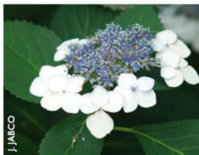
H. serrata 'Tokyo Delight'

'Tokyo Delight' - White, serrated sterile florets age to light rose; complemented by pink fertile florets. Hydrangea Collection.