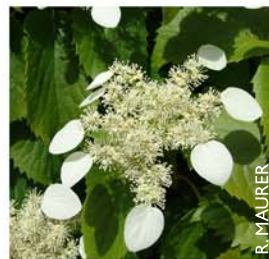
H. anomala ssp. quelpartensis

A climbing vine that attaches to supports with aerial roots. Aromatic, 6-10-inch summer blooms sport numerous creamy white fertile florets, irregularly ringed by showy white sterile flowers. Glossy round leaves provide a nice background for blooms that age to light green and then tan. Older stems feature exfoliating cinnamon brown bark. Grows 50-60 feet. Isabelle Cosby Courtyard.