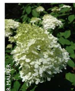
H. paniculata 'Limelight'

Late summer heralds long pyramidal, mainly white panicles that open in succession from bottom to top for a long-lasting effect. Arching gray branches bear olive green leaves, 3 to 6 inches long by 3-inch wide. Each leaf has finely toothed margins and small, bristly hairs. Native to Asia; multistemmed; up to 24 feet tall.