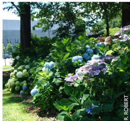
The Hydrangea Collection

The individual florets feature two types of flowers—fertile and infertile. Tiny infertile flowers peak out from the center of the cluster, while the large infertile (sterile) flowers steal the show, attracting both people and pollinators. The "petals" are actually sepals, which protect the flower bud before it opens.