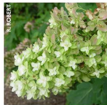
H. quercifolia 'Snow Flake'

'Pee Wee' - Compact form growing 2 to 3 feet tall and wide. North side of Hicks Hall.