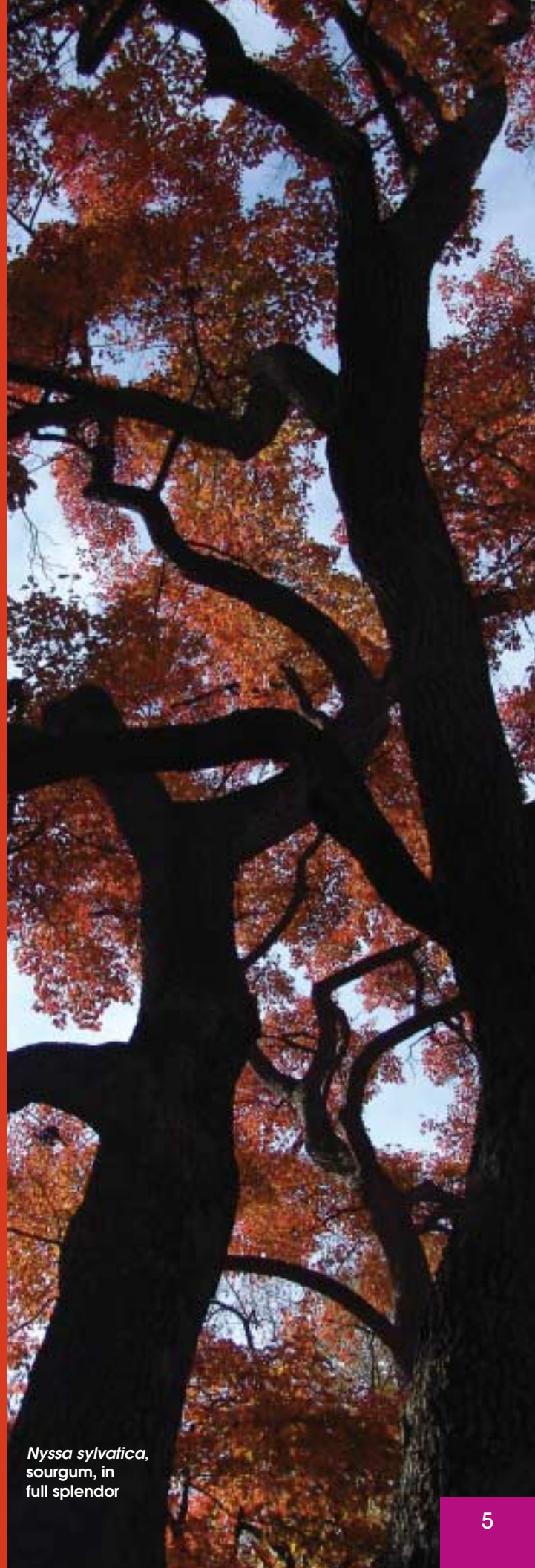
Nyssa sylvatica , sourgum, in full splendor