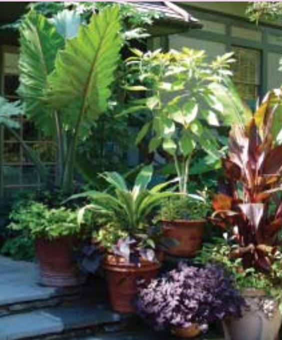
Containers at the Scott office entrance

In 2006, 217 hours were given by Arboretum volunteers maintaining our library of books, magazines, newsletters, and catalogs for the benefit of Scott Associates who can browse and borrow from the horticultural holdings. For the year from July 2005 through June 2006, 541 books were circulated.