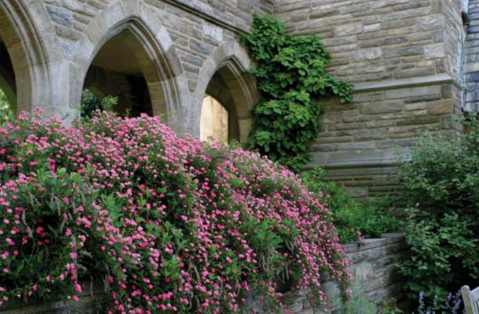
A scene in the Theresa Lang Garden of Fragrance

January until March allowed participants to travel vicariously to gardens around the world along with peripatetic professional horticulturists. In 2006, the program's 15th year, a total of 672 participated; an average of 96 per lecture, compared to an average of 72 in 2005.